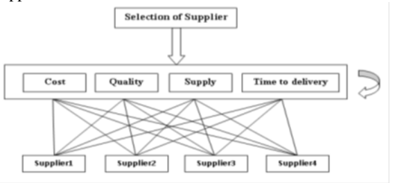
Figure 2: ANP model for supplier evaluation.

The ANP model formed by the factors determined in the first step is shown in Fig. 2. ANP model is composed of three stages. In the first stage, there is the goal of determining factor weights. There are factors related to them in second. The factors of second stage are connected to the goal with a single directional arrow. The arrows in the second stage represent the inner-dependence among the factors. The third stage represents various alternate suppliers which are to be ranked.